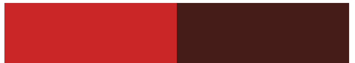
Examples: Bright Red & Claret

Using coloured paper is another differentiation opportunity for marketers and creatives to stand out amongst the crowd and not one to be overlooked. It is one of the most powerful elements of design for direct mail and other marketing materials; increasing brand identity, comprehension and reader participation.